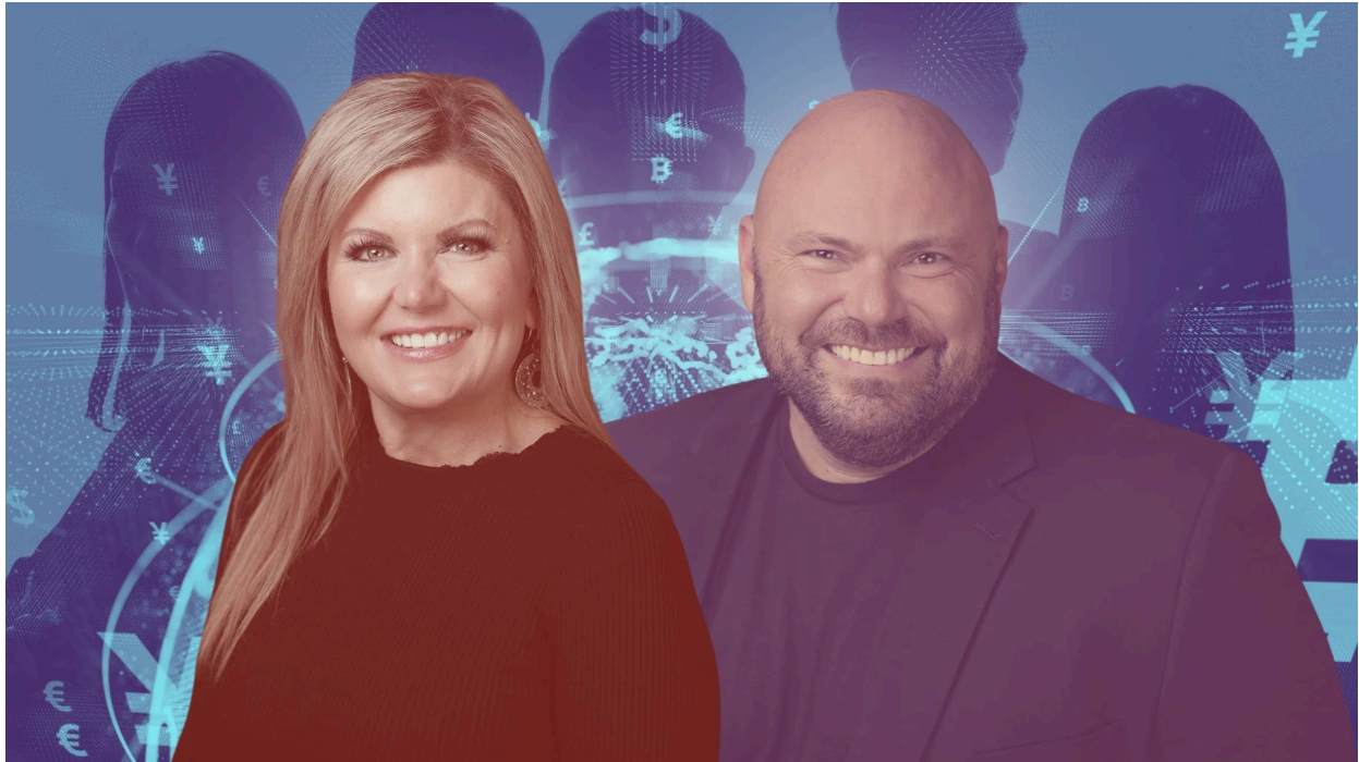
Canva and ERS.

The Nebraska-based company's agents will now be a part of eXp, while the parent company merges with Good Life Capital in a bid to build an all-in-one platform